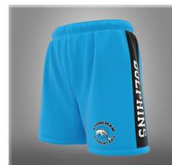
SHORTS & TRAINING