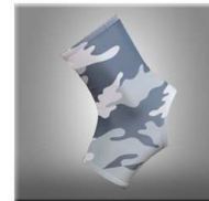
ARM SLEEVES & CLEAT COVERS