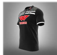
POLOS & T-SHIRTS