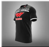
POLOS & T-SHIRTS