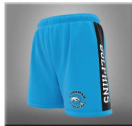
SHORTS & TRAINING