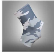
ARM SLEEVES & CLEAT COVERS