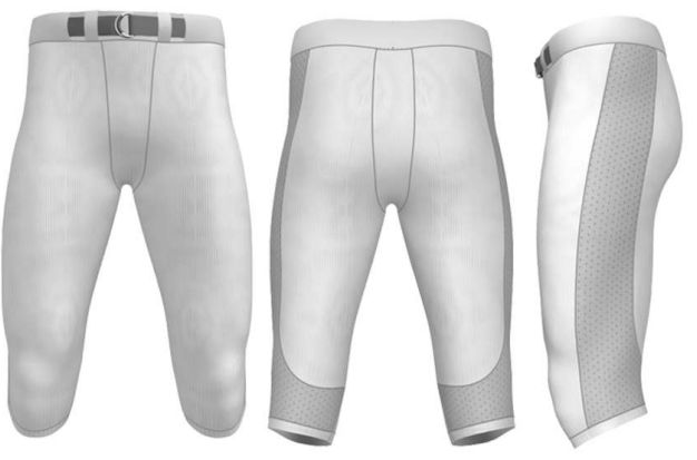
GAME DAY PANT PART# AFB-PS-112 (SUBLIMATED)/AFB-PH-112 (HYBRID)