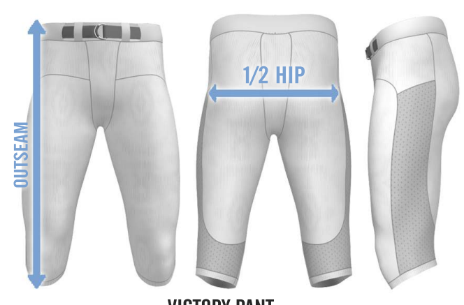
VICTORY PANT PART# AFB-PS-110 (SUBLIMATED)/AFB-PH-110 (HYBRID)