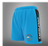
SHORTS & TRAINING