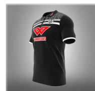
POLOS & T-SHIRTS