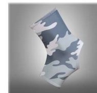
ARM SLEEVES & CLEAT COVERS